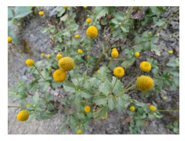
Fig. 1: A. oleracea in plantation.

A. oleracea was harvested during October-November 2015 from Ngopa, a village in Champhai District, Mizoram, India (located between 23.8861° latitude north and 93.2119° longitude east). Only the fully mature and flowering plants were selected (Fig. 1). A voucher specimen was