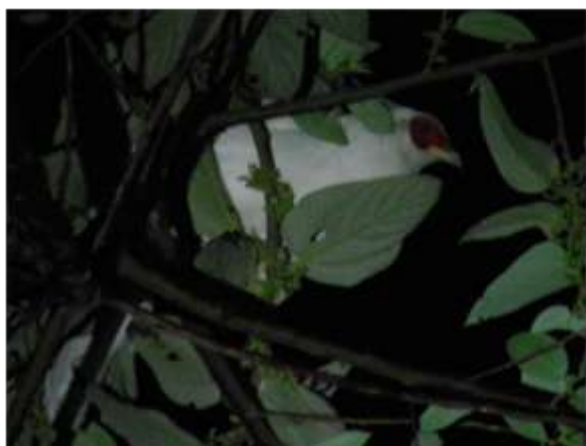
Figure 1. Albino Kalij Pheasant.

prevalent in the study areas during 2006-2008. But their population seems to be re-established and stable. These two species are recorded in 82% protected areas. L. leucomelanos is the most common pheasant species in Mizoram. It is recorded in all 11 (100%) protected areas. It is widely distributed in the state irrespective of vegetation and altitudinal variations.