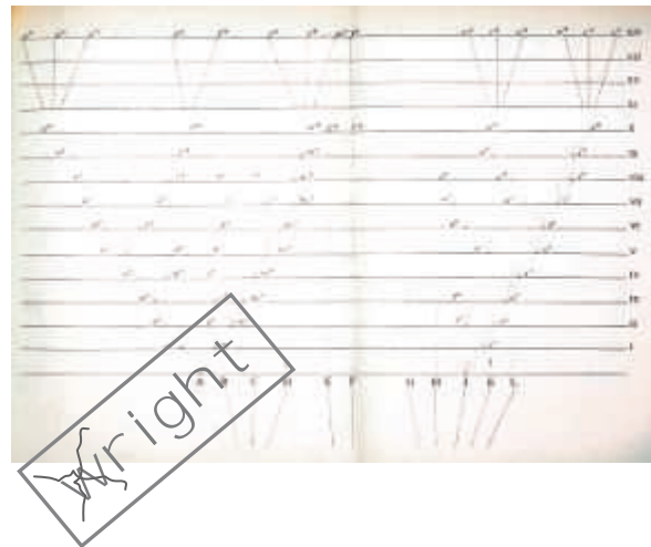
Figure 2.1. The Tree of Life as imagined by Darwin; the only figure in the On the Origin of Species .

As the maxim goes: to err is human, to forgive unnecessary The author claims no meddling of the hand of God; it was just callousness